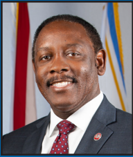
Orange County Mayor Jerry L. Demmings